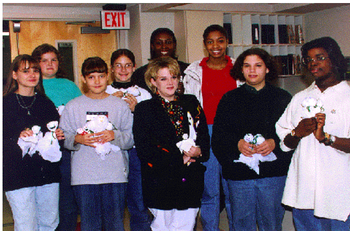
The Madison County 4-H Honor Club members delivering ghost “suckers” to patients in the pediatric wing of the Jackson/Madison County General Hospital.

Such good deeds do not go unnoticed. The Madison 4-H All Stars and Honor Club have twice won JCPenny Golden Rule awards for community service, with cash awards totaling $1,250. True to their giving spirit, the 4-H'ers voted to use the monies to support additional service projects, such as building a memorial gazebo at the Ellington 4-H Center and creating a wildlife trail for the community.