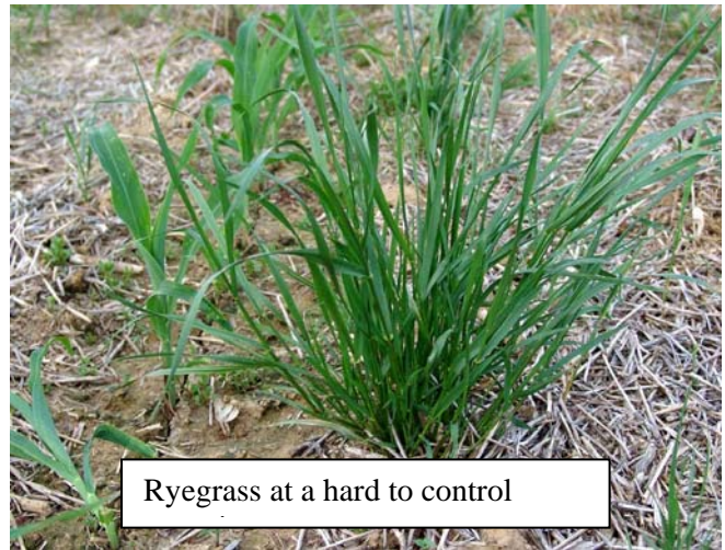
Ryegrass at a hard to control