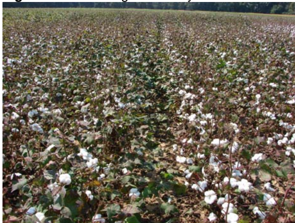
Figure 1. Aim Managed Maturity