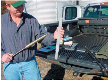
Illustration 1. Deepcup grain probe.

The deepcup (torpedo) grain probe is the most commonly used sampler available commercially. The deepcup grain probe (Illustration 1) consists of a separate brass or plastic cup about 8 to 12 inches long with a connected top, which separates upon removal from the grain, allowing a specified amount of grain to enter the cup. A separate handle and extension rod connect to the top of the cup, providing up to 12 or more feet of extension.